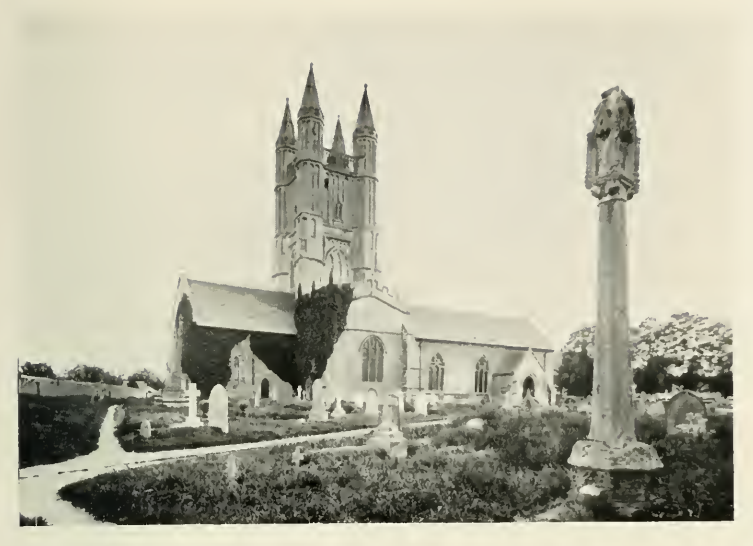
Saint Sampson's Church and Cross, Cricklade.